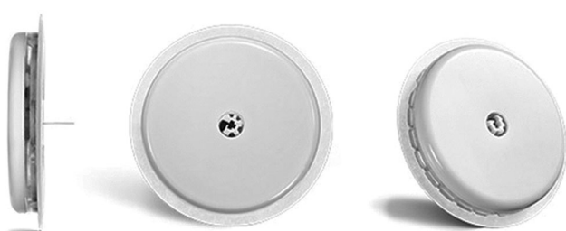
Figure 1: Freestyle Libre continuous glucose monitoring patch.

'I would like to know how my baby is because I had to have a premature baby because of the dangers that I had since they discovered that I got high blood pressure.