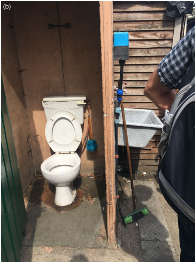
Figure 6b. Shared backyard toilet facility.