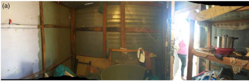
Figure 4a. Interior of backyard dwelling.