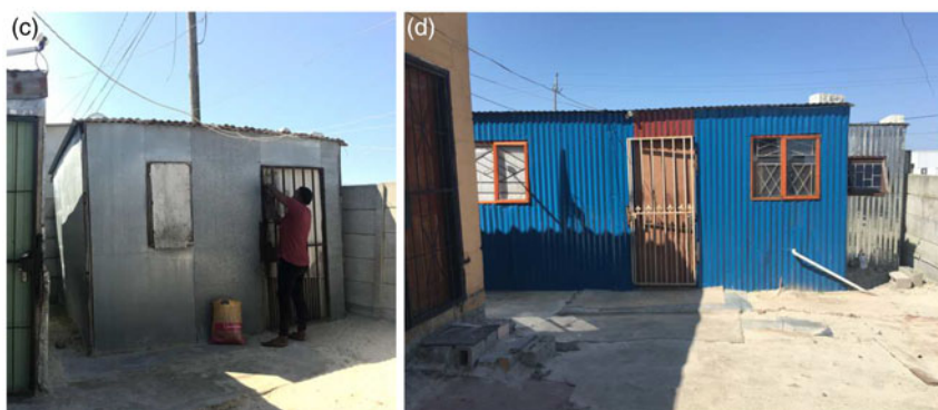
Figure 3c/d. Metal shack example.

While these three communities are broadly similar in terms of socio-economics, they also vary in key ways. First, Delft sits at an important public transportation junction, which makes it appealing to young professionals who need cheap accommodation and an easy commute into the city centre. As such, there is a remarkably high concentration of backyard shacks, probably due to its prime location in the transportation network of the Cape Flats. Delft is also racially and ethnically diverse, made up of black African and coloured residents. The type of backyard housing is quite diverse: beyond the basic corrugated iron and wood shacks that are quite typical, there is a growing number of more robust (cement, bricks, etc.) single and double storey flats given a growing population that is able to afford higher quality flats (Scheba & Turok 2020).