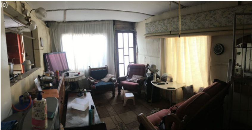
Figure 5c. Upgraded shack interior.

Clearly, the evidence provided here suggests that resources for upgrades, while an important issue, is not the only issue preventing upgrading. Landlords and their relationship with tenants also play a key role in undermining dignity and ability to upgrade one's BD.