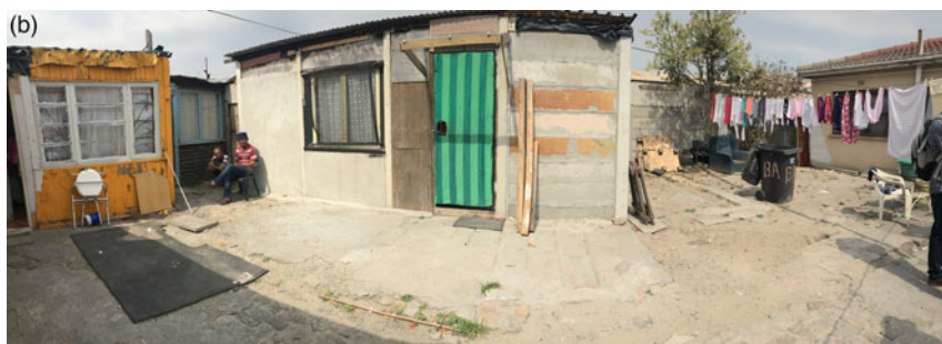
Figure 5b. Improved shack exterior.

linked up the electricity. But that was an agreement [because I'm] living with family' (BV 4 ). Yet even in those situations of permanency and tenure security, the architectural survey recorded that improvements were modest and the quality of accommodation would still fall well below reasonable standards. Only few BDs surveyed had been considerably extended, with improvements such as the use of more solid building materials, distinct kitchen areas, bathrooms inside the home, and separate spaces for bedrooms (see Figure 5 ).