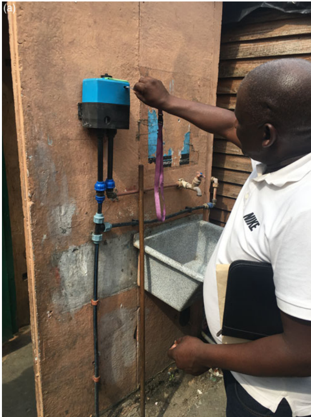
Figure 6a. Example of water meter installation within backyard area.

like me I've got my own toilet because I'm staying alone in the yard. Then the next neighbour, she got her own toilet with her own tag. She can't use her tag on my thing, because it won't work' (PW11). While this city-led programme has improved the material access to services for some backyard dwellers living on council-owned land, it has also encountered several challenges of implementation, including the disruption of existing tenant–subtenant relationships, power struggles over resource flows, technical difficulties, and unclear and unfunded responsibilities for the maintenance of the facilities (HSRC 2019: vi).