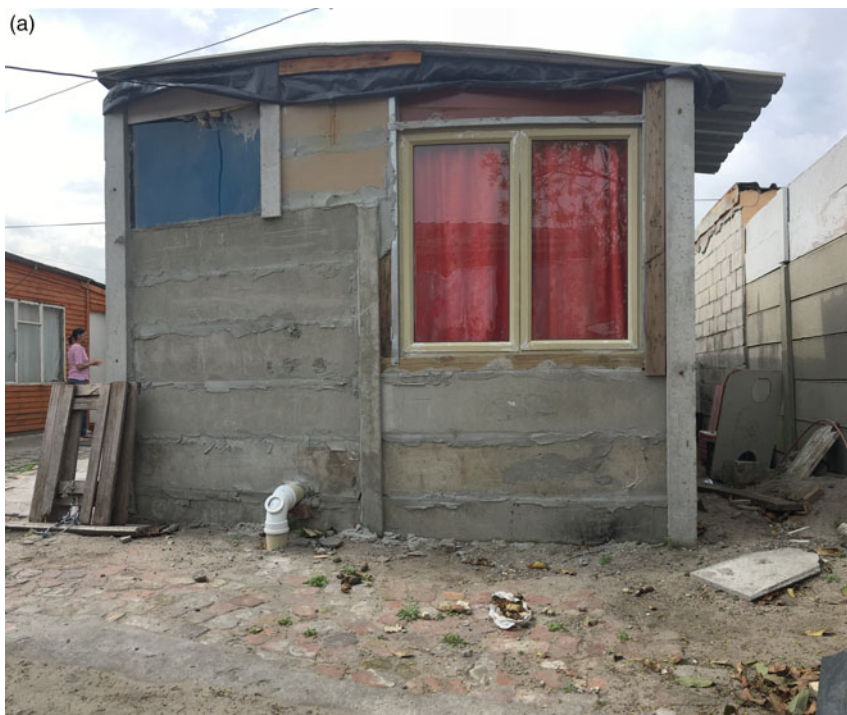
Figure 5a. Upgraded shack exterior.