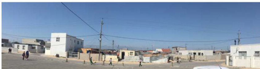
Figure 1. Urban landscape with mix of formal housing and backyard dwellings.

services than those in informal settlements (Morange 2002; Lemanski 2009; Shapurjee & Charlton 2013; Brueckner et al. 2019). This suggests that for many, it is a positive choice to live in a BD because it improves upon other informal living options (Turok & Borel-Saladin 2016).