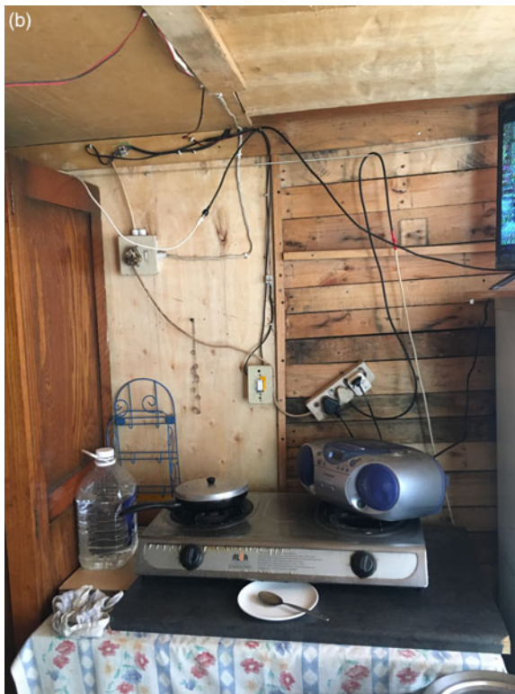
Figure 4b. Kitchen area in backyard dwelling.

The situation differed for backyard dwellers renting from immediate family members, who demonstrated that under a situation of tenure security and sense of collective ownership, investments are more likely. Characterised by longer tenancies and more durable relationships, familial relationships often provided more enabling conditions for tenant-led upgrades to the structure and service provision; for example: ‘I have put in a toilet, a basin; I’ve water. I