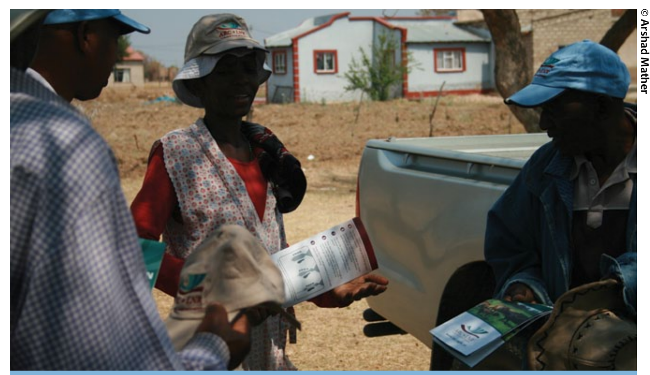
Emerging farmers discussing an information pamphlet developed within the project

control of resources and benefits; participation and decision-making; and gendered needs of farmers. The findings will lay the foundation for further research on gender-sensitive innovation in livestock farming systems. A second study will evaluate the economic impacts of two diseases (LSD and RVF) on the South African economy and emerging farmers.