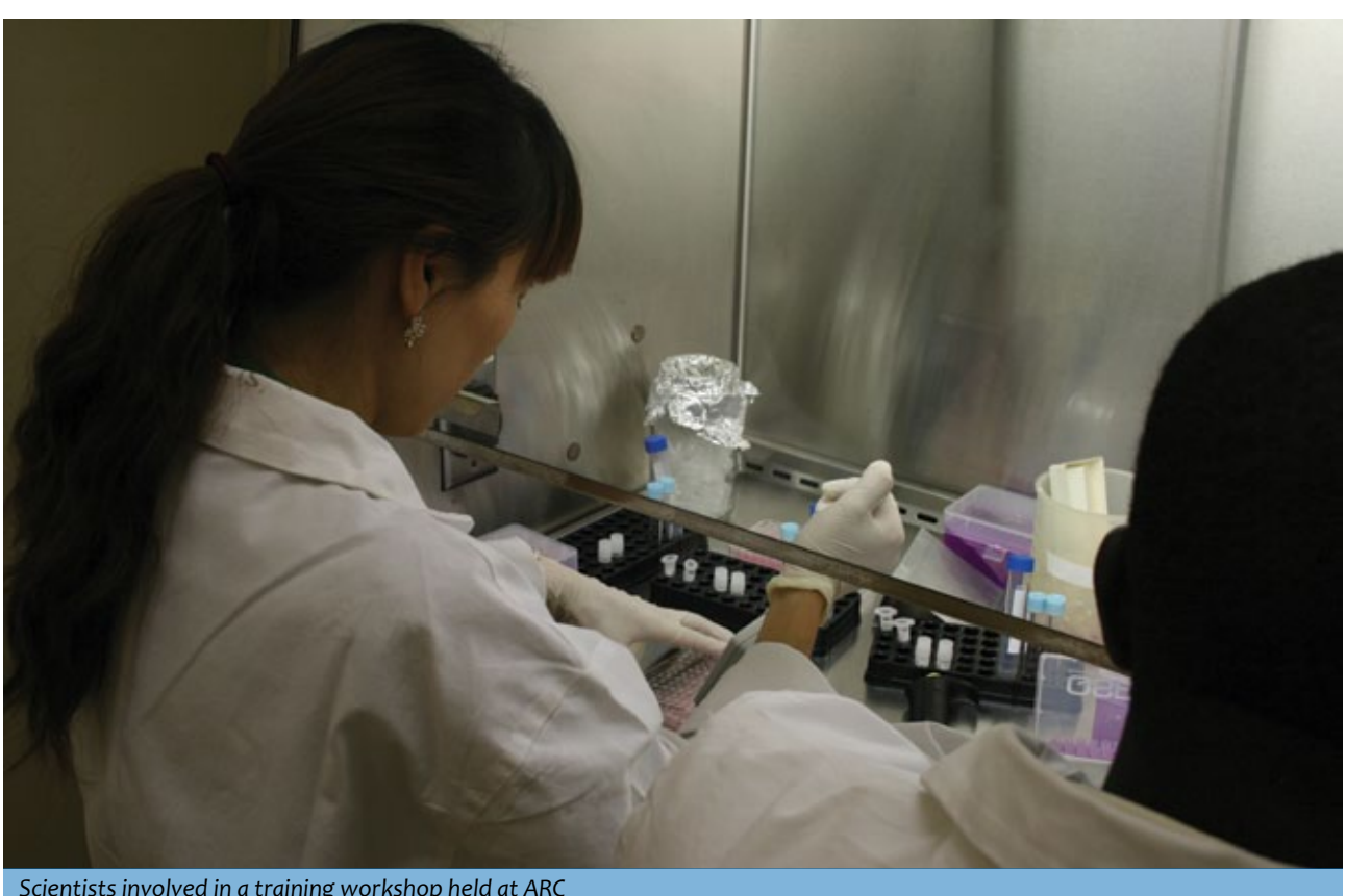
Scientists involved in a training workshop held at ARC

Central to the analysis is the idea that empowering women farmers, through access to markets, production resources and information, can increase agricultural output and reduce poverty and inequality. Key concepts that will be examined include: the gendered division of labor among emerging farmers; access to and