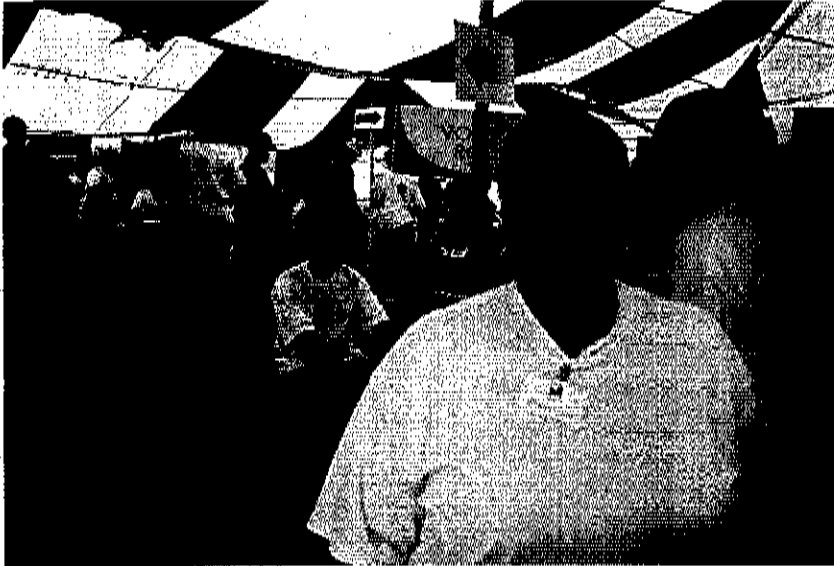
Figure 7: Bakerton, Springs