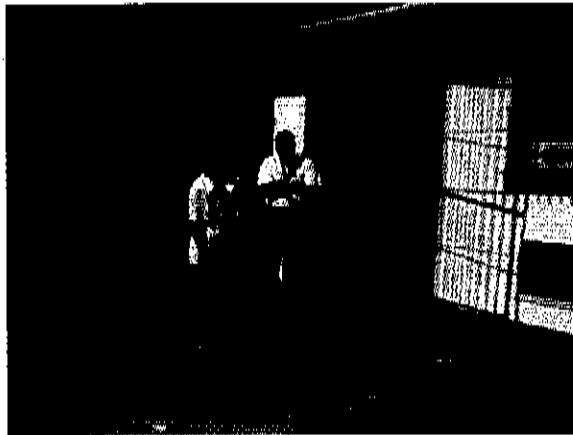
Figure 1: Lentegour, Mitchell's Plain