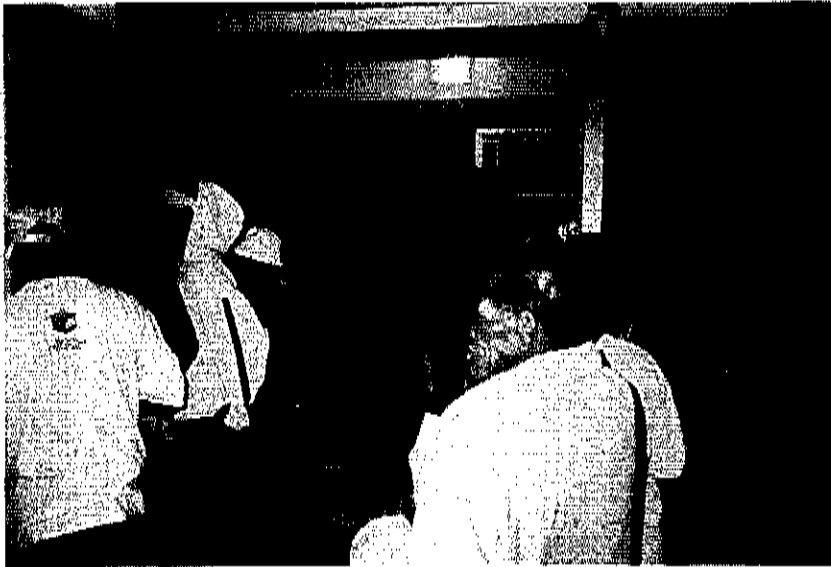
Figure 6: Osizweni, KwaZulu-Natal

More than nine out of ten voters (92,4%) expressed the belief that nobody would know for which party they had voted in the elections, thereby implying that their ballot is secret. Certainty about this was highest in the Western Cape at 97,2%, and lowest in Limpopo at only 84,8%. About one out of twenty (4,8%) respondents did not believe their vote was confidential, and 2,6% said that they did not know either way. Clearly, if such information is totally confidential, it needs to be communicated more effectively, especially to the voters of Limpopo and the Eastern Cape.