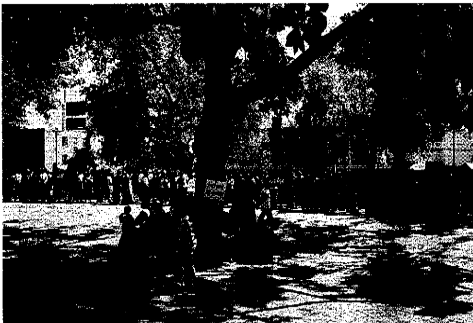
Figure 4: Yeoville, Johannesburg

minutes. The rest waited for between one and two hours (10,1%) or in 9,6% of cases, in excess of two hours.